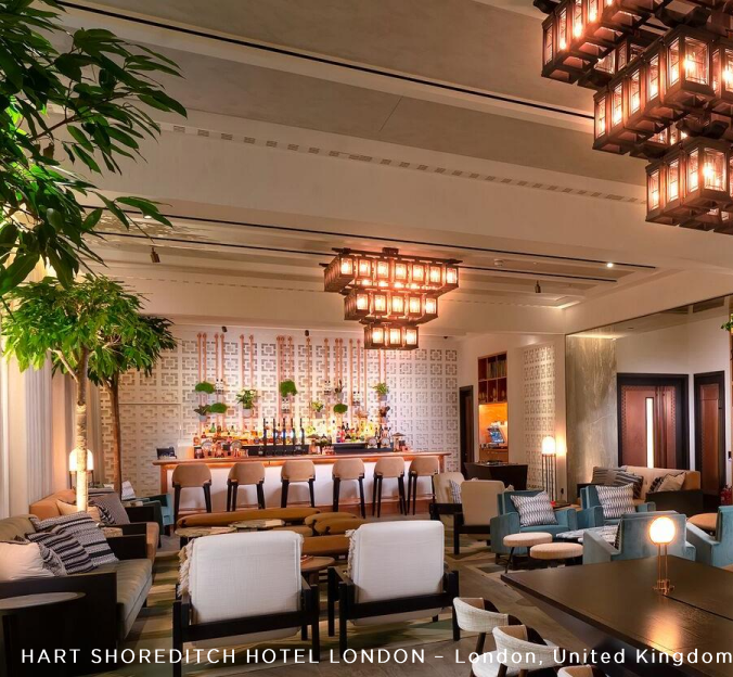
HART SHOREDITCH HOTEL LONDON - London, United Kingdom