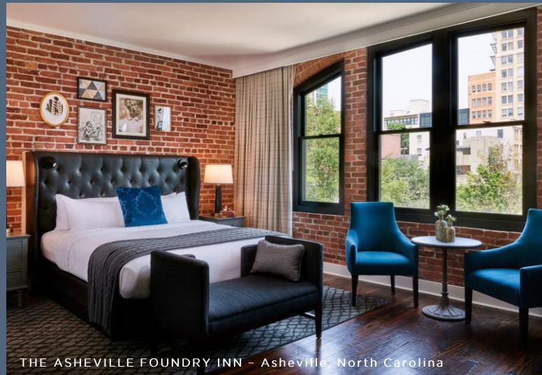
THE ASHEVILLE FOUNDRY INN – Asheville, North Carolina

Curio Collection guests are passionate, independent-minded travelers seeking local and authentic experiences, who value the added peace-of-mind that comes with the Hilton name and Hilton Honors™ program.