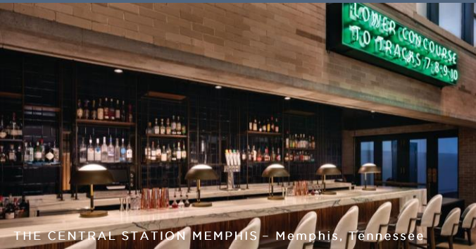
THE CENTRAL STATION MEMPHIS - Memphis, Tennessee

Global Honors Contributions - 59.3% YE 2019