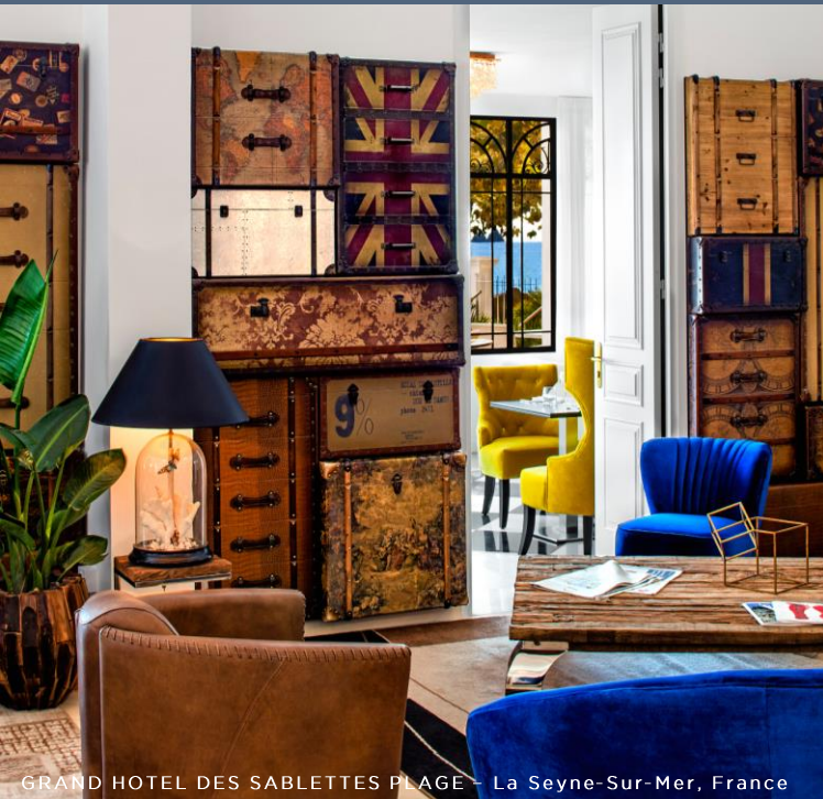
GRAND HOTEL DES SABLETTES PLAGE – La Seyne-sur-Mer, France

Curio Collection by Hilton™ is a global set of remarkable hotels hand-picked for their unique character and personality. Each hotel is part of the destination it calls home – embodying the distinct culture and spirit of the community in which it resides. From urban landmark properties to grand beach resorts, these hotels are one-of-a-kind, with individuality as the only unifying factor. These hotels have elevated finishes and grand arrival experiences that contribute to each guest's stay.