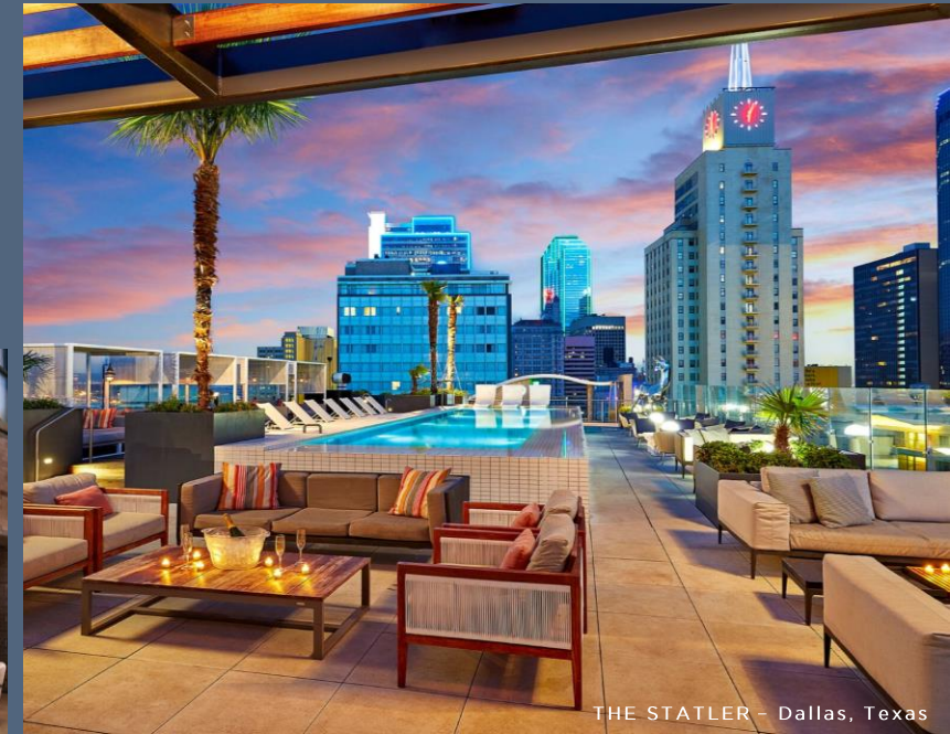
THE STATLER - Dallas, Texas