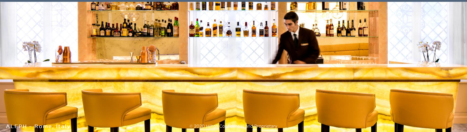
ALEPH – Rome, Italy

Curio Collection guests are passionate, independent-minded travelers seeking local and authentic experiences, who value the added peace-of-mind that comes with the Hilton name and Hilton Honors™ program.